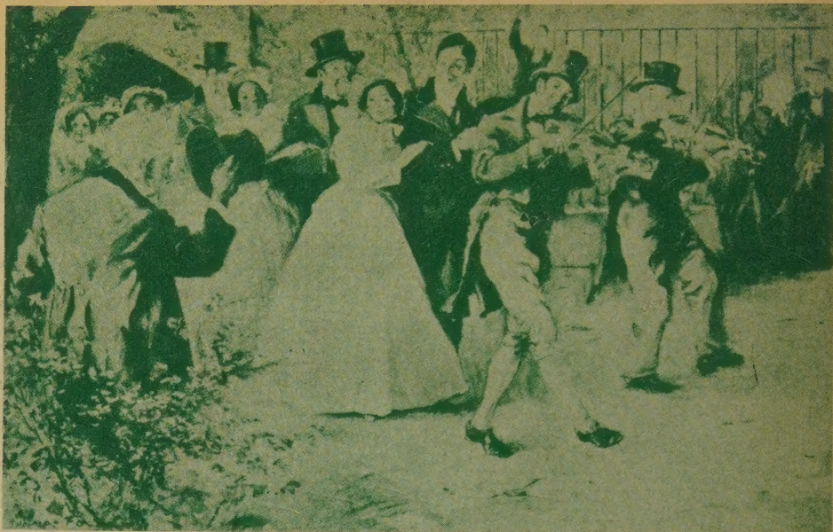
Illustration from YOURSELF AND THE NEIGHBORS by Thomas Fogarty